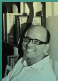
Luiz Ruffato - Writer (Brasil)