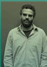
Gonçalo M. Tavares - Writer (Portugal)

Conversations with writers, shows and other art-dedicated moments are only some of events provided by the FLM where there is also room for the youngest among us with the "Festivalinho - Fli" (the Junior Literary Festival), an initiative that aims to introduce children to the FLM, promoting and providing greater contact with books, authors, writers and illustrators.