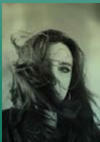
Adriana Calcanhotto - Artists (Brasil)