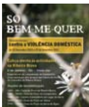
Exhibit within the campaign against domestic violence "Só Bem-Me-Quer" Ribeira Brava City Hall – Exhibitions Room Rua do Visconde, 56 – Ribeira Brava