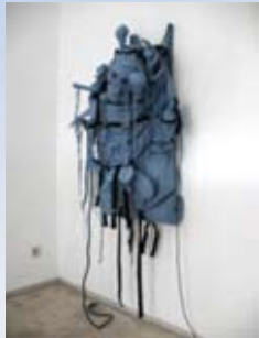
> DEAD MAN WALK, 2008 Fabric, cotton ribbon, strings, laces, filling-up paste, tin-foil, wire and several objects.