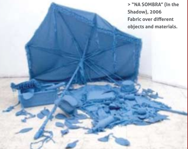
> "NA SOMBRA" (In the Shadow), 2006 Fabric over different objects and materials.