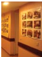
Photo display of the activities organized by the Casa do Povo de São Roque do Faial

Casa do Povo de São Roque do Faial Pico do Cedro Gordo - São Roque do Faial