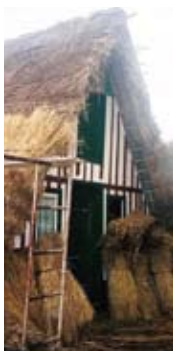
Photo exhibition and display of traditional miniature cottages Project: "Access to the reservations room"