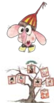
Illustration exhibition by Pascalqb Madeira Ethnographic Museum - Temporary Exhibitions Room

Rua de São Francisco, 24 - Ribeira Brava