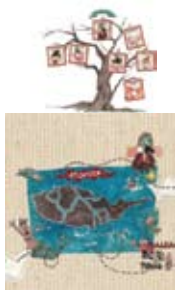
Illustration exhibition by Pascalqb

Madeira Ethnographic Museum - Temporary Exhibitions Room