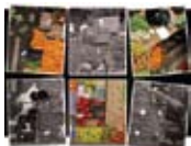
Photo exhibition by the attendants of Machico's Occupational Activities Centre Espaço Mercado - Rua Gago Coutinho e Sacadura Cabral - Ribeira Brava