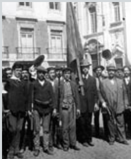
October 5th - 1910, AML-AF

October 5th marks 100 years over the establishment of the Portuguese Republic. An event of deep symbolism, in which are recalled the reasons and goals of the implementation of this new political regime, where the aspirations and search for a more fair and egalitarian country have left behind a destroyed and outdated monarchy.