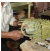
Photo exhibition by Mara Lúcia Temporary exhibition room - Electricity Museum “Casa da Luz” Rua da Casa da Luz, 2 - Funchal Tuesday to Saturday: 10 a.m. to 12.30 p.m. and from 2 p.m. to 6 p.m. www.maralucia.com